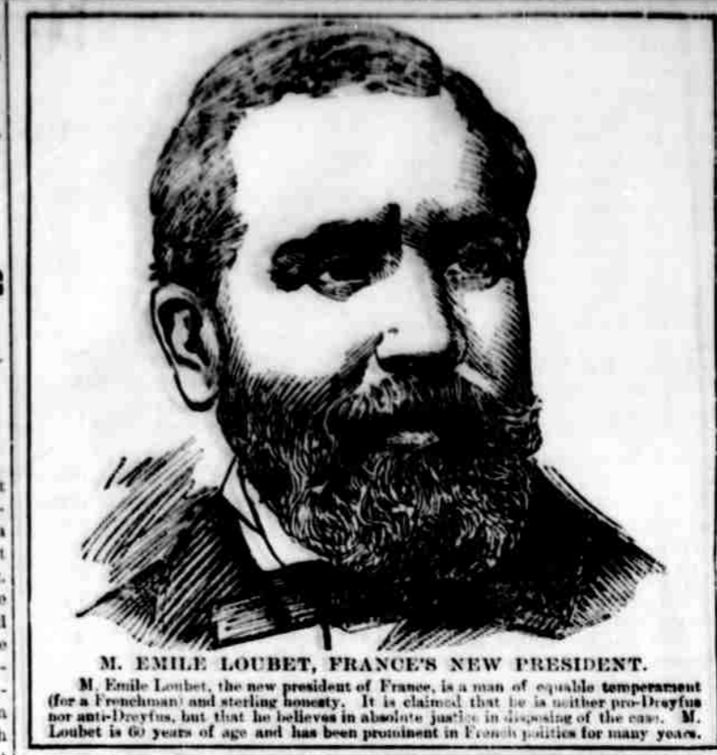
M. EMILE LOUBET, FRANCE'S NEW PRESIDENT.

The Foreign Office of the Republic of Hawaii has received a graceful note