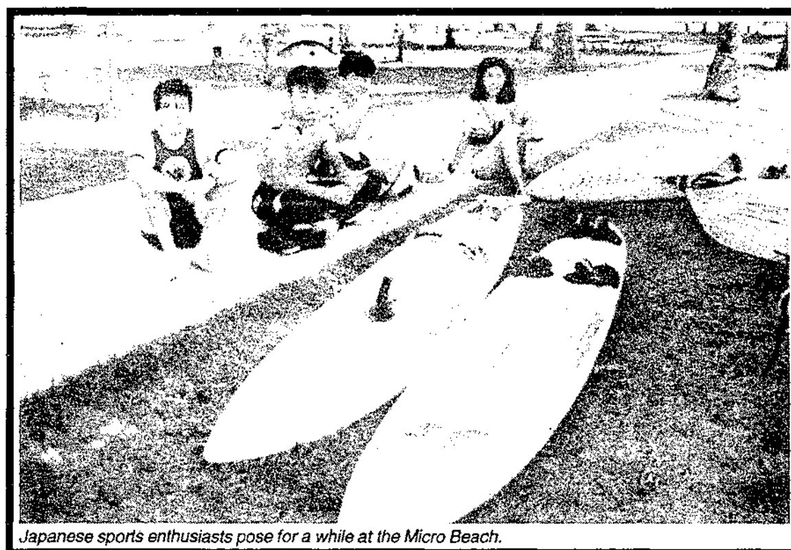
Japanese sports enthusiasts pose for a while at the Micro Beach.